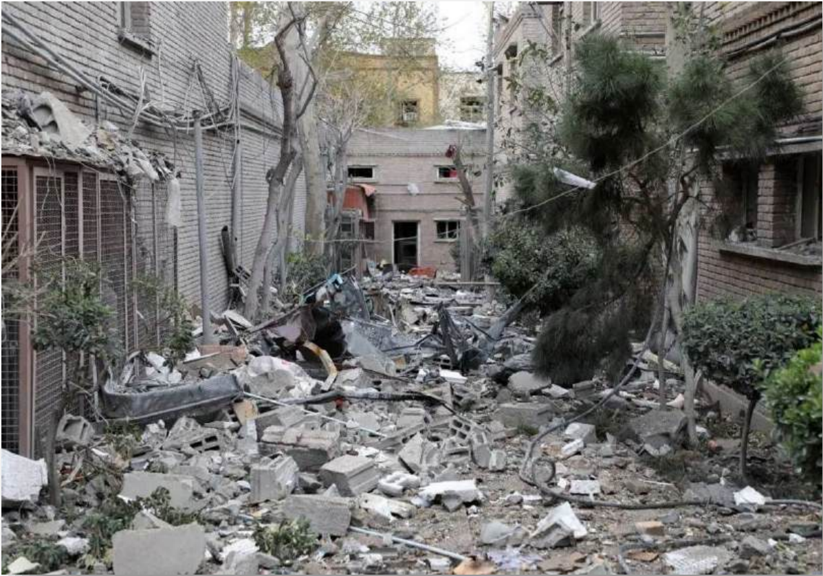
Ruins of parts of the Pasteur Institute of Iran after the US-Zionist unlawful attacks. The Institute is the symbol of scientific advancement in medical research in Iran, among others.