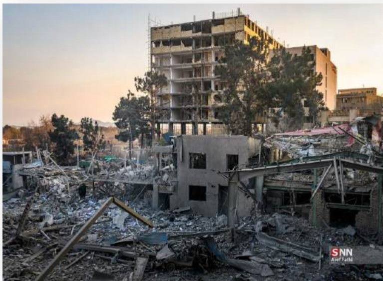
Aftermath of US-Israeli regimes' criminal attacks against a residential building in Mohammadshahr, Karaj.