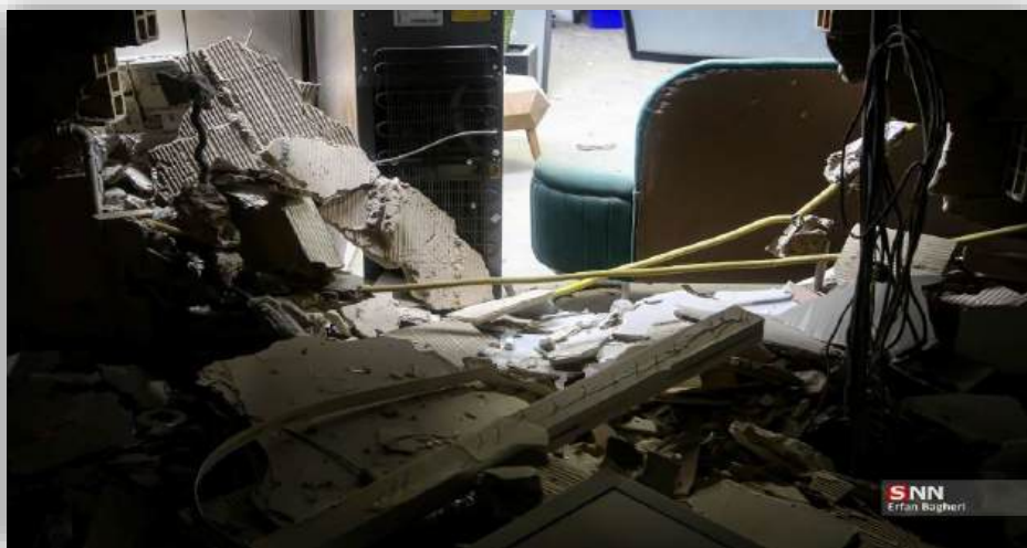
The Gandhi Hospital in Tehran sustained severe damage after the US-Israeli attacks on 1 March 2026.