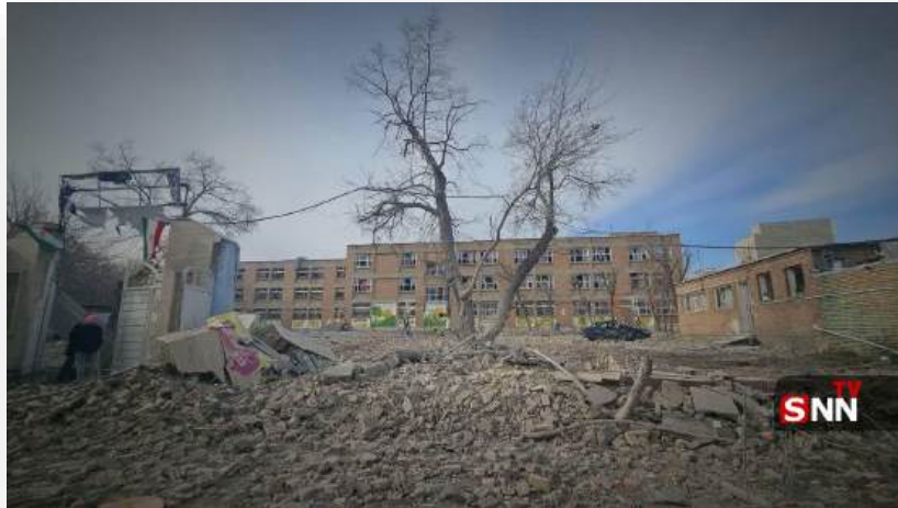
A snapshot of the rubble of Esmat girls' school in Urmia, in north-western Iran, which was severely damaged by the US and Israeli regime's air raids.

143. In Urmia, another girls' school "Esmat" sustained considerable damage.