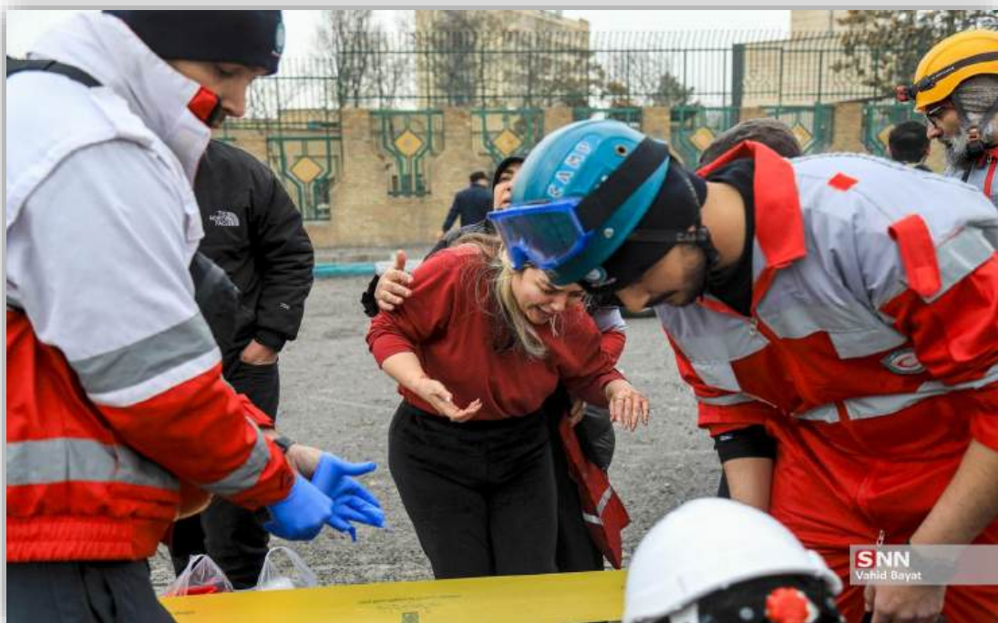
A lady injured by the indiscriminate attacks of the aggressors in Tehran being helped by the Red Crescent.