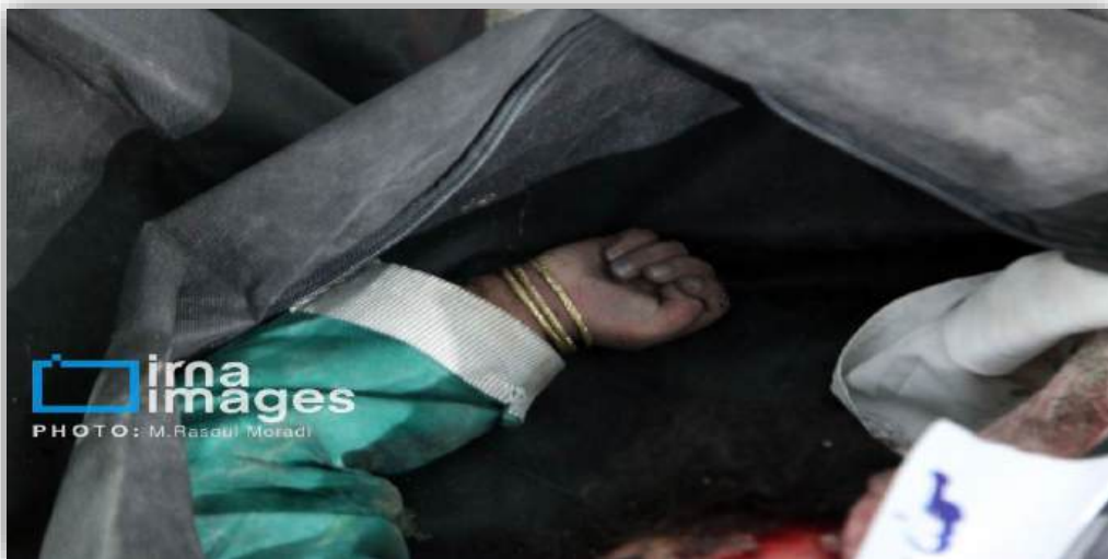
The partial photoshoot of the body of one of the schoolgirls fallen victim to an American war crime.