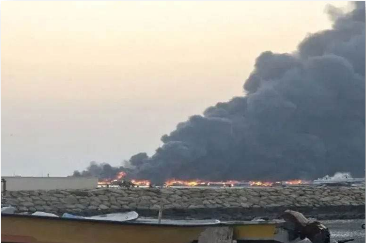
Mahshahr Petrochemical after the criminal US-Zionist attack dispersing heavy pollutants in the air against IHL principles and rules of international environmental law.