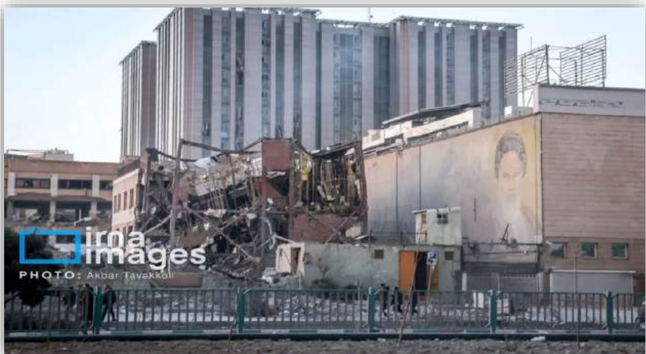
The aftermath of direct attacks against civilian objects in Shahid Fakouri neighborhood, Tehran.