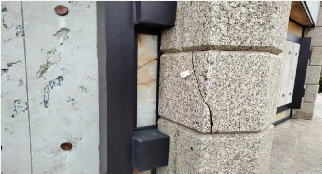
Baba Taher's tomb was damaged due to reckless attacks of US-Zionist forces in Hamedan. Baba Taher is a highly revered mystic poet in Iran and has been widely read for generations.