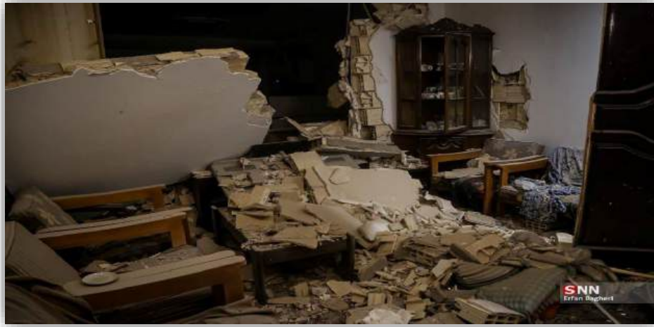
Another snapshot of one of the wards Gandhi Hospital in Tehran after the US-Israeli attacks on 1 March 2026 which led to considerable damage to the hospital.