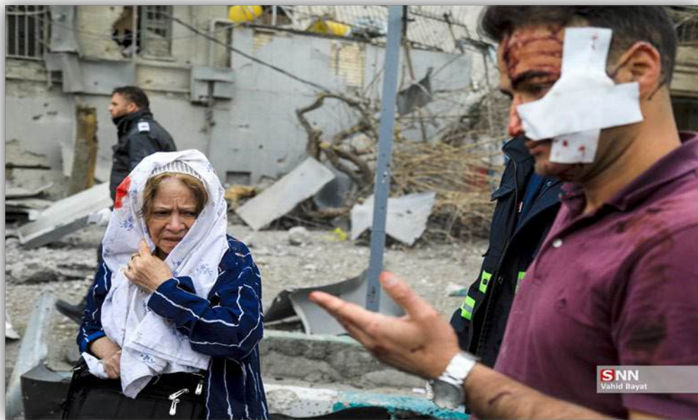
With rubble in the background, a lady injured in the US-Zionist aggression in Tehran.