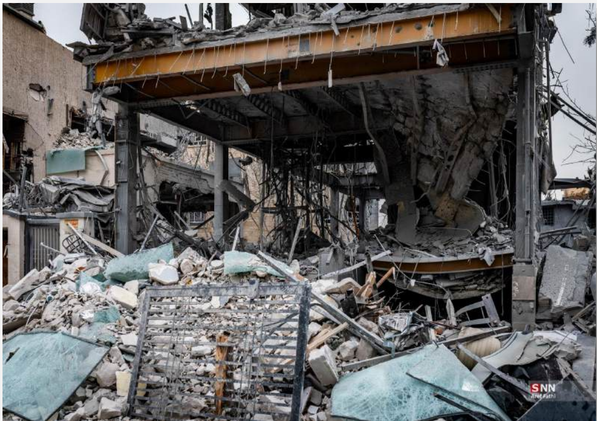
The aftermath of US-Israeli regimes' criminal attacks against a residential building in Karaj.