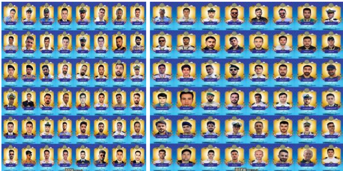
Directing deliberate attacks by the US armed forces against an Iranian frigate “Dena” far from the battlefield claimed the lives of at least 87 crew members.