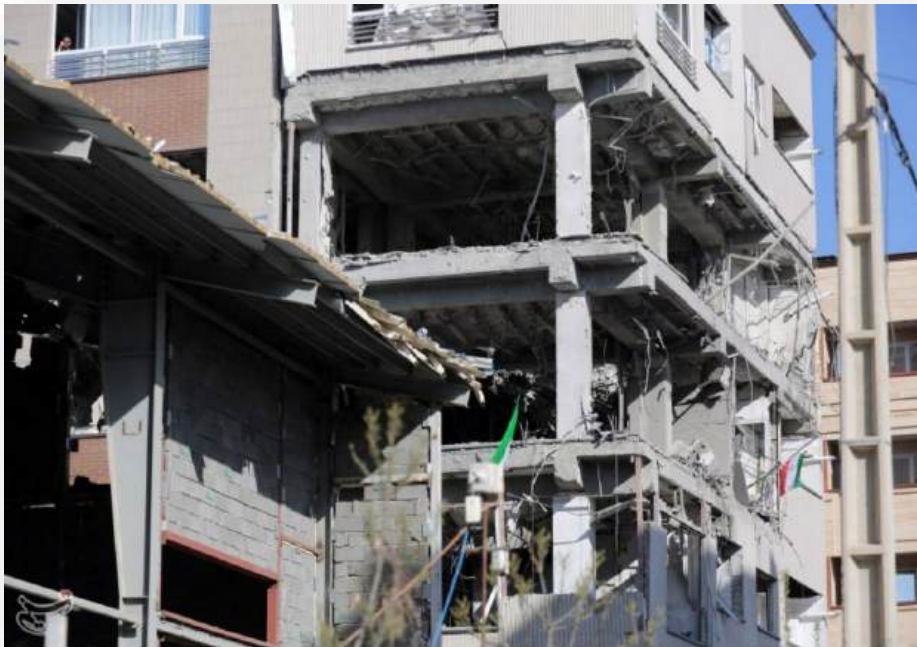
Aftermath of US-Israeli regimes' criminal attacks against a residential building in Hamedan.