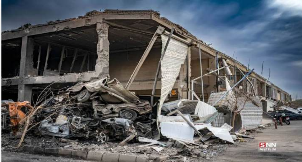
The aftermath of direct attacks against an industrial area in Karaj.