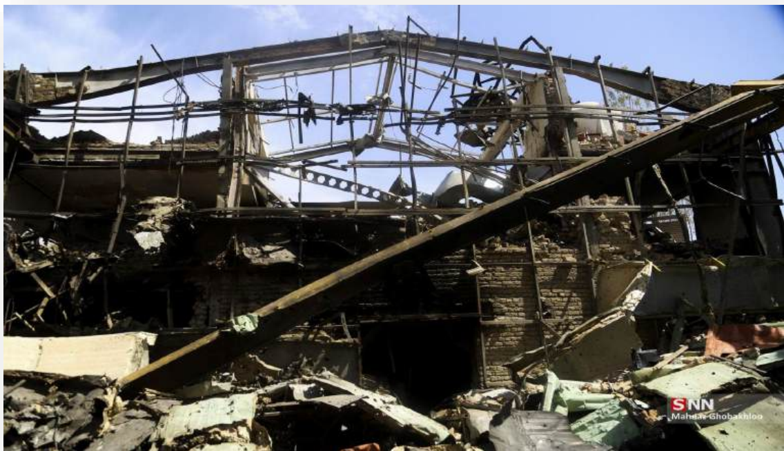
One of the buildings of Shahid Beheshti University after an unlawful attack by the US-Israeli regimes' armed forces.