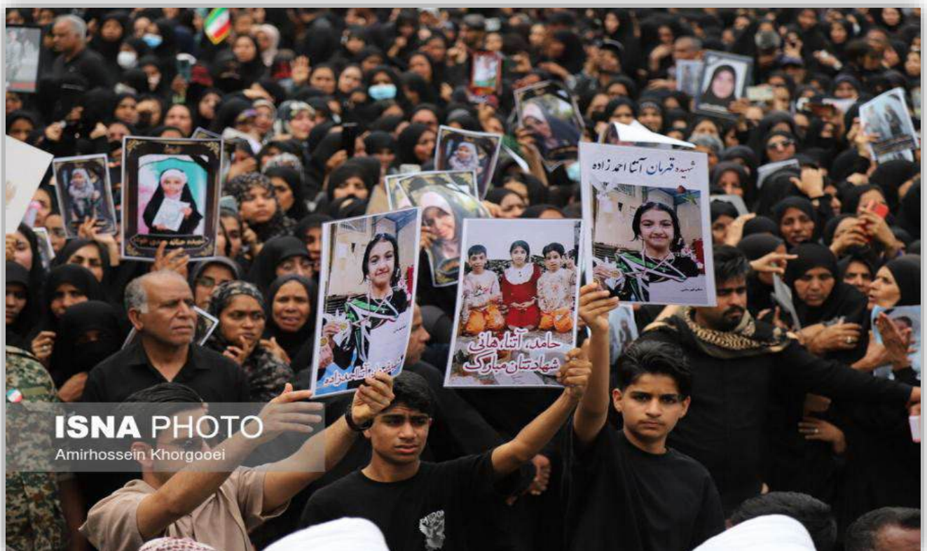
Demonstrators holding the pictures of schoolgirls martyred by American missiles on the Shajareh Tayyebah primary school in Minab, Hormozgan.