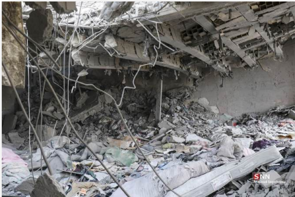
Aftermath of US-Israeli regimes' criminal attacks against a residential building in Tabriz.