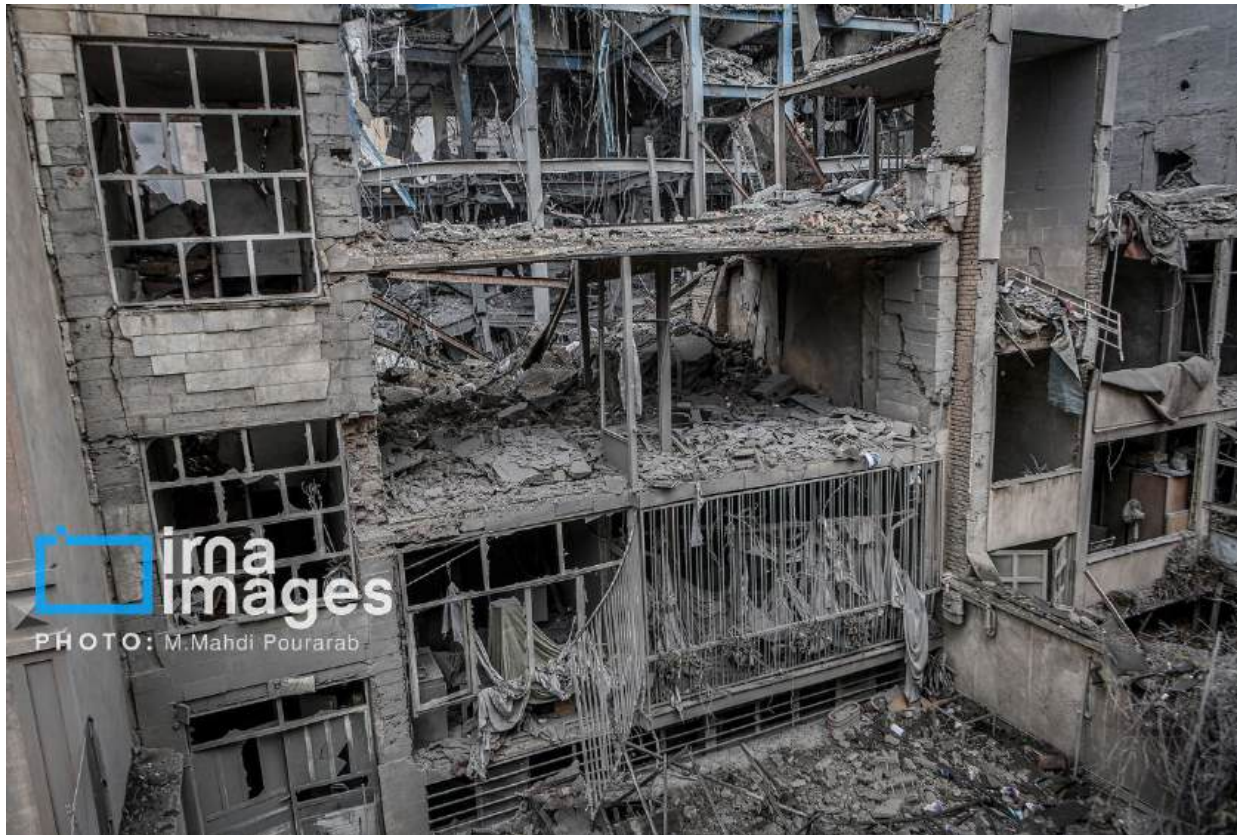
Aftermath of US-Israeli regimes' criminal attacks against a residential building in Tehran.