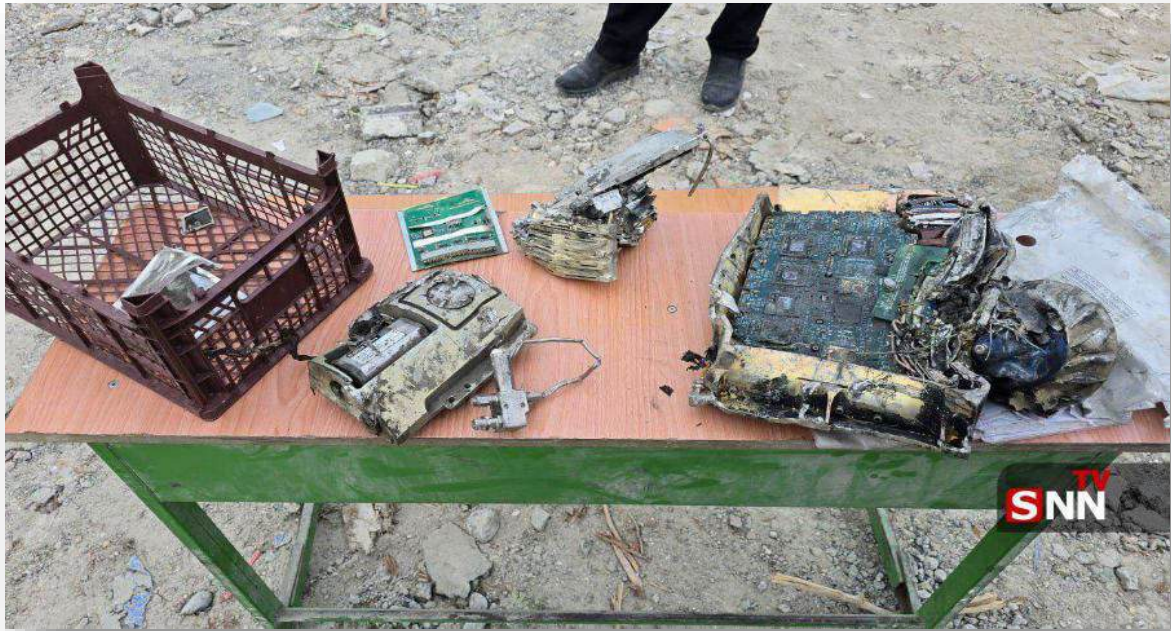
The remnants of an American missile used to bomb the primary school.