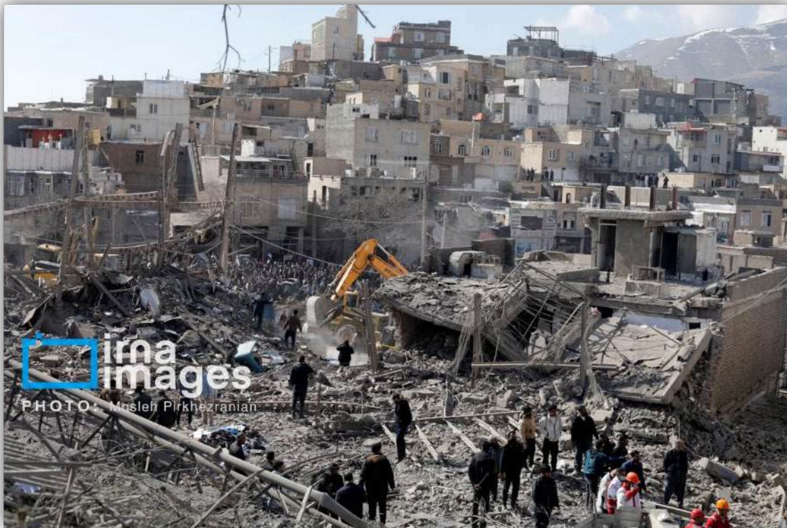
The aftermath of attacks on a densely populated area in Sanandaj, Kordestan province.