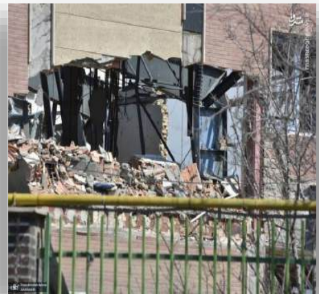
The 12000-seat Azadi Stadium, an icon of the collective memory of generations of athletes, ruined by 7 missiles in the deliberate attacks of the US and Israeli regime.