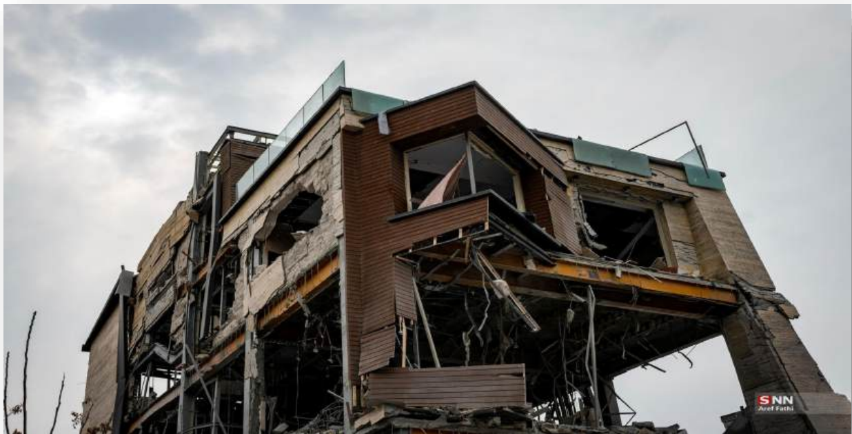
Aftermath of US-Israeli regimes' criminal attacks against a residential building in Karaj.