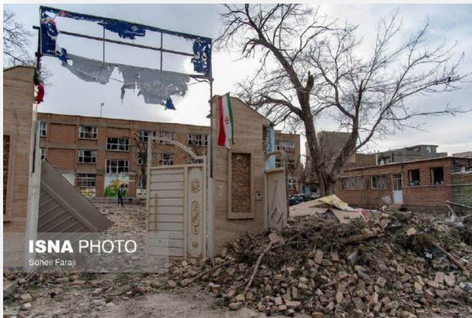
The Imam Reza boys' school in Abyek, Qazvin, was seriously damaged. An innocent schoolboy was killed and 3 of his schoolmates were injured.

144. In Abyek, Qazvin, the "Imam Reza" boys' school was targeted by cowardly strikes of the aggressors leading to the martyrdom of a student and injury of several others.