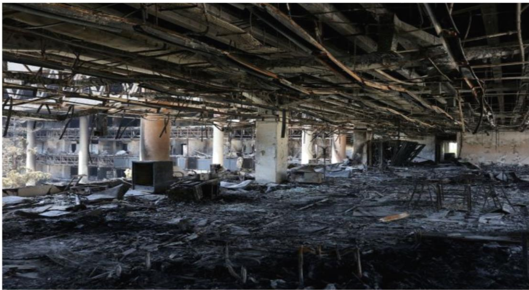
Before and After: Iran's IRIB building, once intact, now damaged following Israeli airstrikes on June 19.