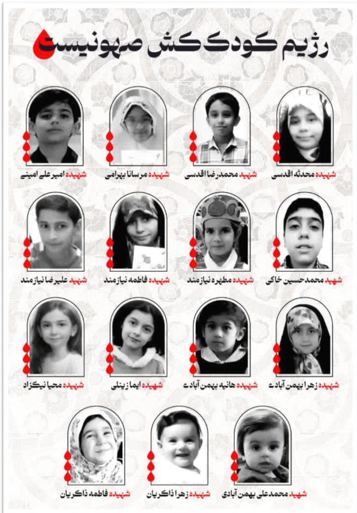
Innocent children martyred in the Zionist regime's strikes on the Chamran residential area, 13 June 2025