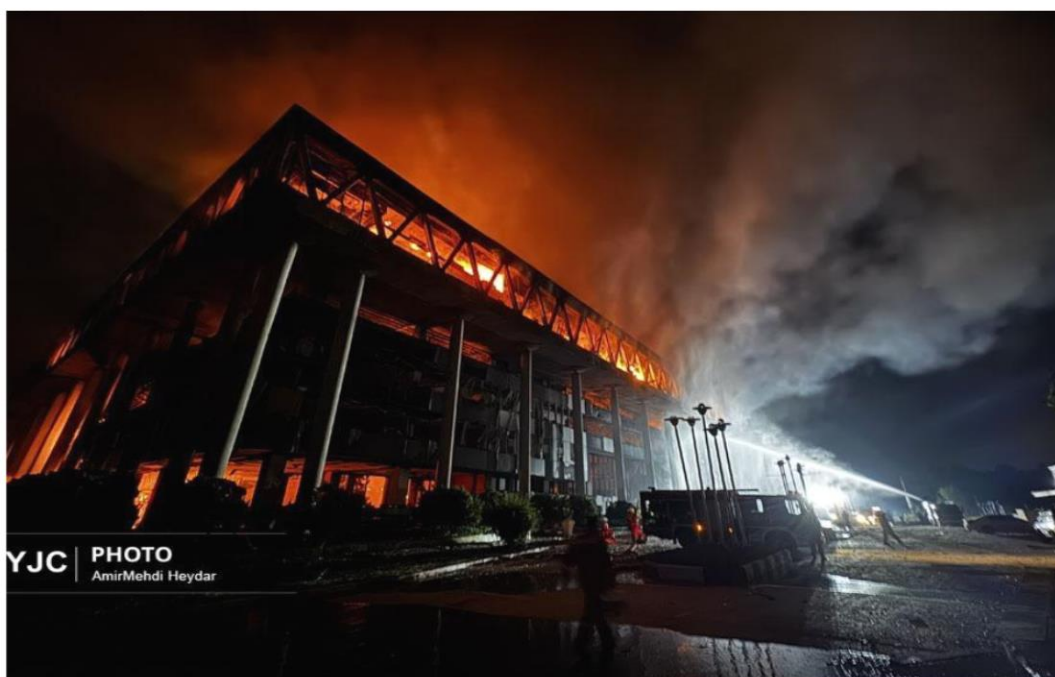
Iran State TV Building on Fire, during attacks on 16 June 2025