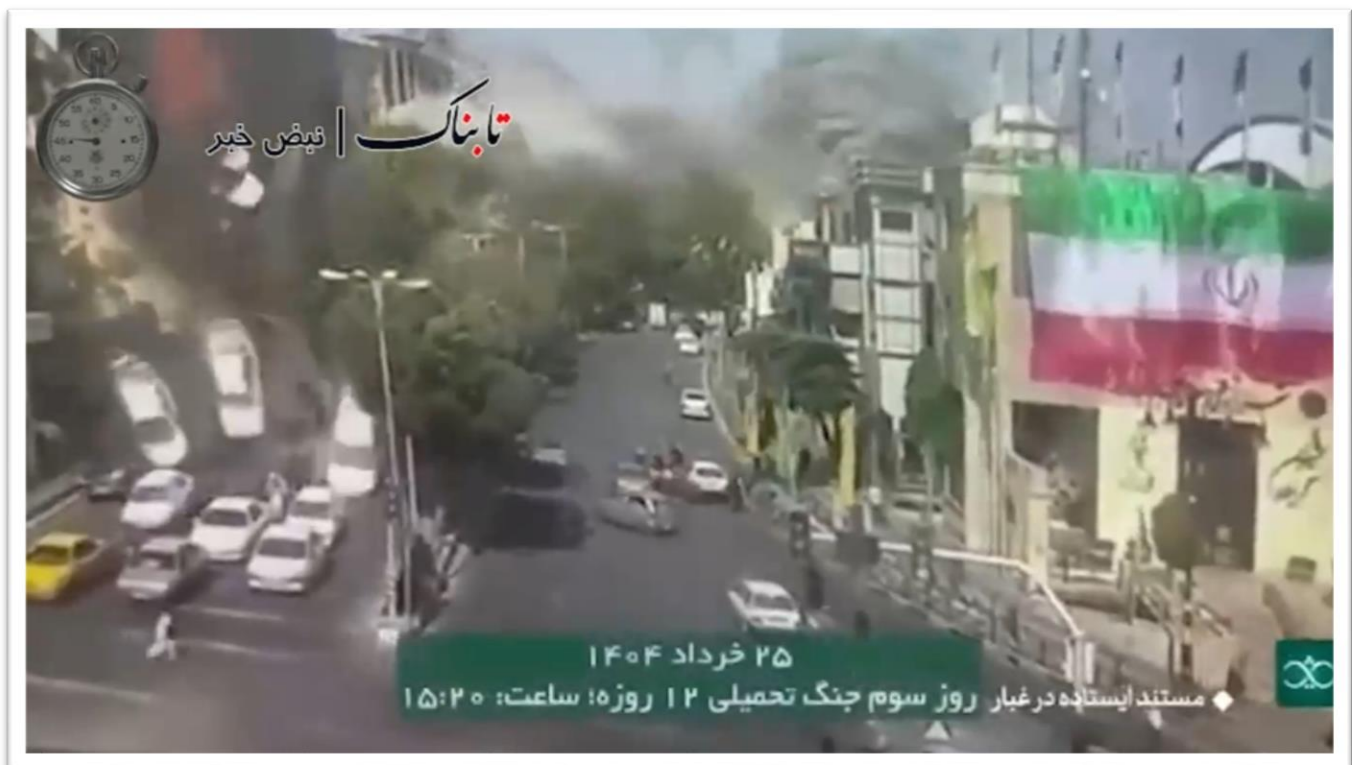
Footage from traffic cameras showing the moment of Israeli regime's brutal attacks in Tajrish neighborhood