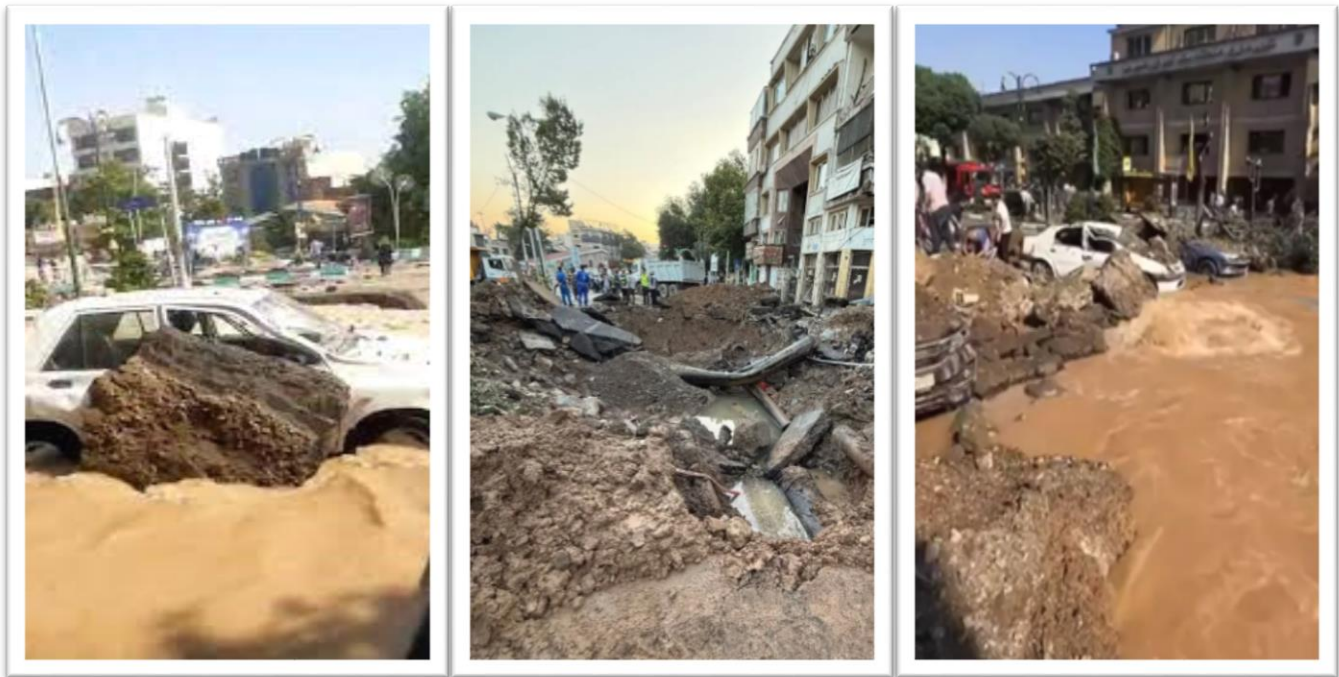
Targeting of main water pipeline led to flooding in Tajrish neighborhood