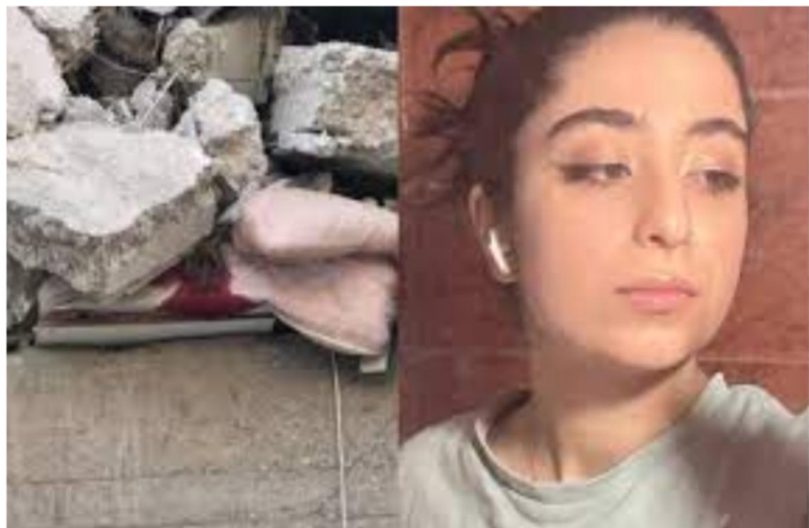
Instances of attacks against civilians