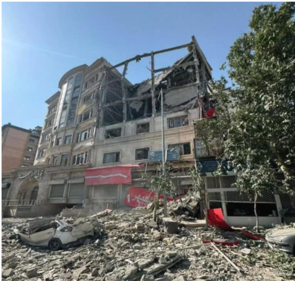
Instances of attacks against civilian objects